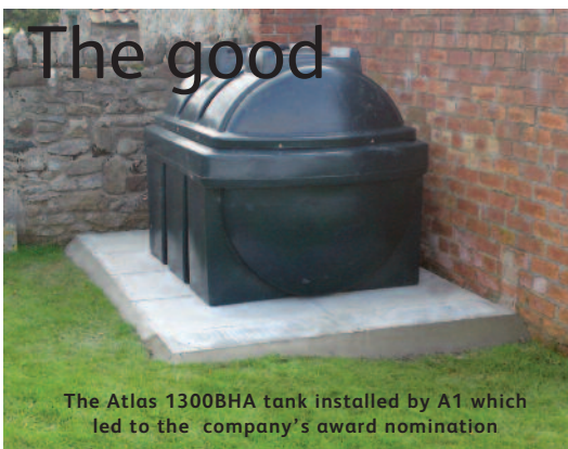
The Atlas 1300BHA tank installed by A1 which led to the company's award nomination